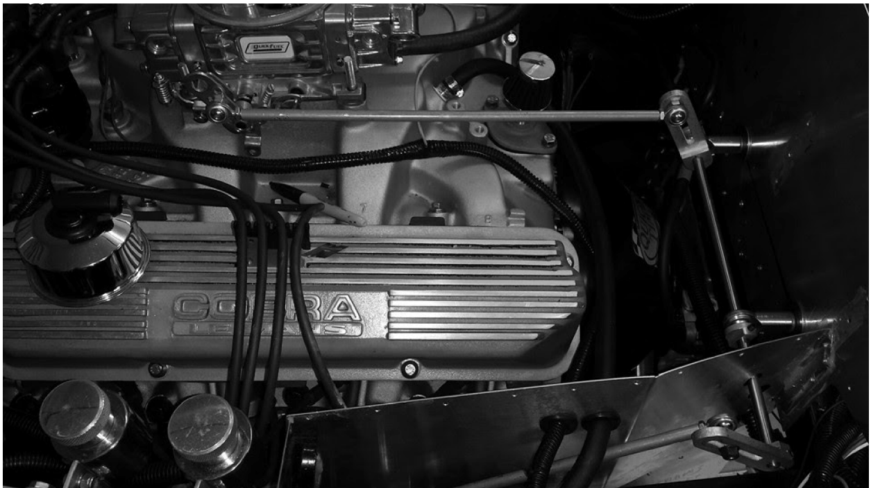
FIGURE THE FIREWALL ROD END POSITION AND MARK THAT POINT.

ATTACH THE ROD END ON THE THROTTLE LINKAGE OF YOUR CARB. WITH THE THROTTLE ROD SQUARE TO THE FIREWALL, MARK THE FIREWALL WITH A SHARPIE THE POSITION OF THE ALUMINUM LEVER.